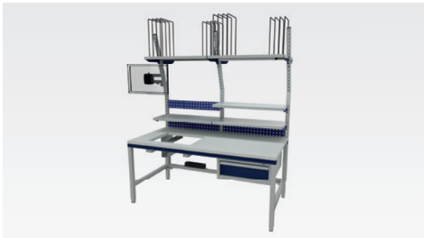
SYSTEM FLEX model 4 & 5 Art. 73001800 (gentian blue) / 73001900 (ruby red) With scale cut-out, various accessories and different accentuating colours.