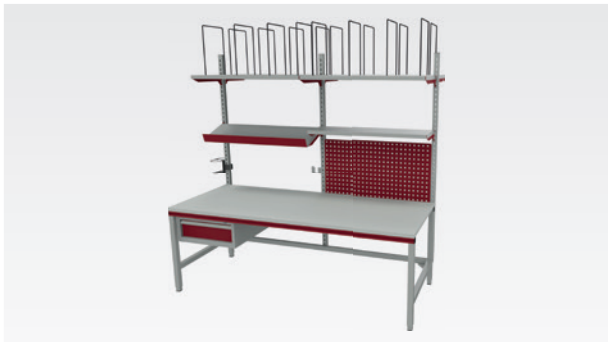
SYSTEM FLEX model 2 Art. 73001600 Like model 1 with additional accessories.