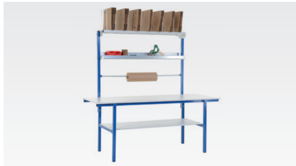
SYSTEM BASIC model 3 Art. 721600 (W 1,600 mm) / 722000 (W 2,000 mm) With bottom shelf.