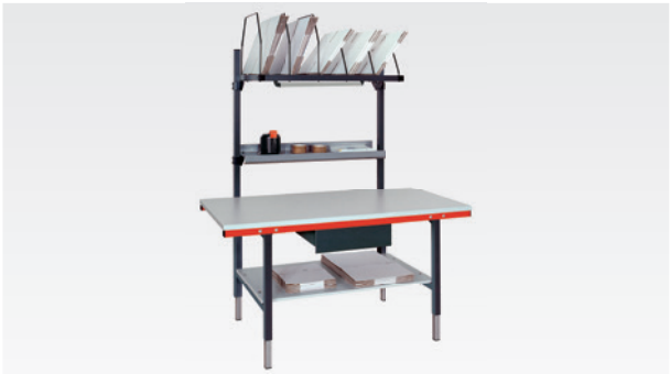
SYSTEM 2000 model 1 Art. 163001 With bottom shelf.

All tables can be customised! Simply use our packing table configurator.