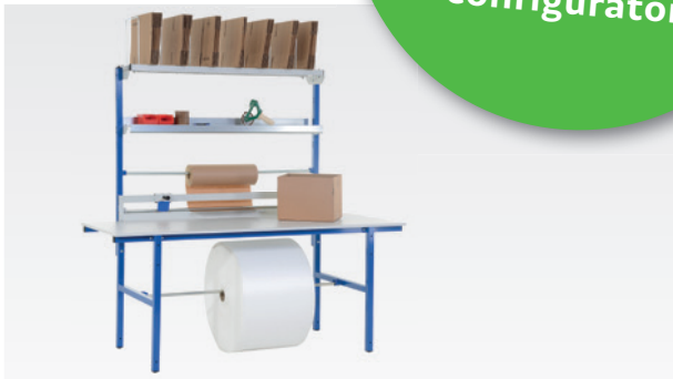
SYSTEM BASIC model 2 Art. 711600 (W 1,600 mm) / 712000 (W 2,000 mm) With cutting device.