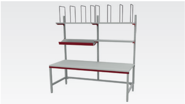
SYSTEM FLEX model 1 Art. 73001500 With shelves and Rocholz mounting profiles with perforation for various accessories.