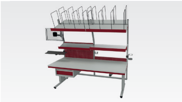
SYSTEM FLEX model 3 Art. 73001700 With electric height adjustment.