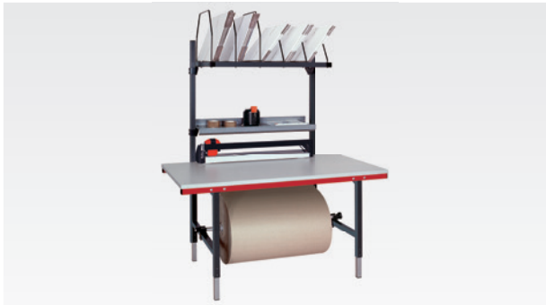
SYSTEM 2000 model 2 Art. 163002 With cutting device.