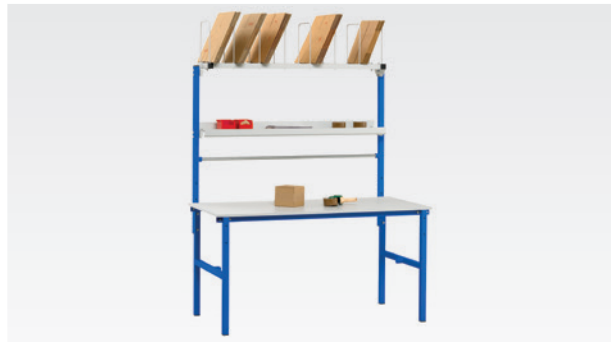
SYSTEM BASIC model 1 Art. 701600 (W 1,600 mm) / 702000 (W 2,000 mm) Spindle between the uprights for holding paper and film rolls.