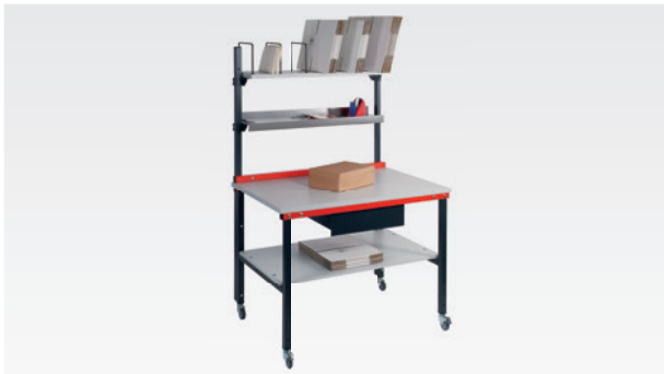
SYSTEM 1200 Art. 123001 Slim and space-saving.

All tables can be customised! Simply use our packing table configurator.